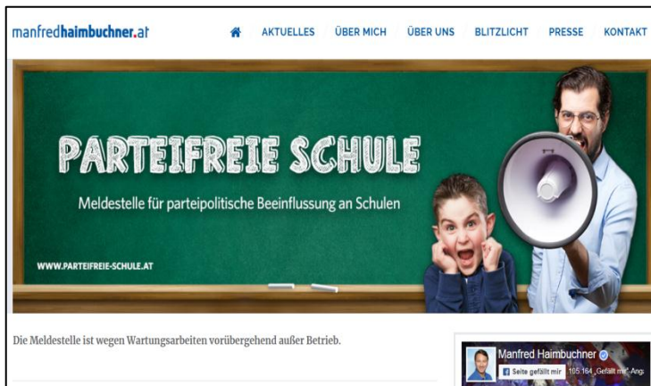
The website for documenting "incidents of political manipulation" in schools.

Kimberger of the teachers' union for compulsory schools expressed disapproval over the fact "that politicians are now putting pressure on teachers." 21